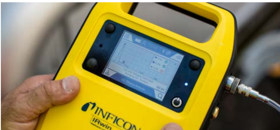
Efficient gas determination in the field.

IRwin is light (1.6 kg, 3.5 lb) and portable for optimum comfort. The instrument and its accessories have been developed for mobile use in demanding conditions. In particular, its modular probe system reduces the number of items the operator needs to carry during pipeline survey. Thanks to quick install fittings, the user can easily apply the correct probe for the specific working situation.